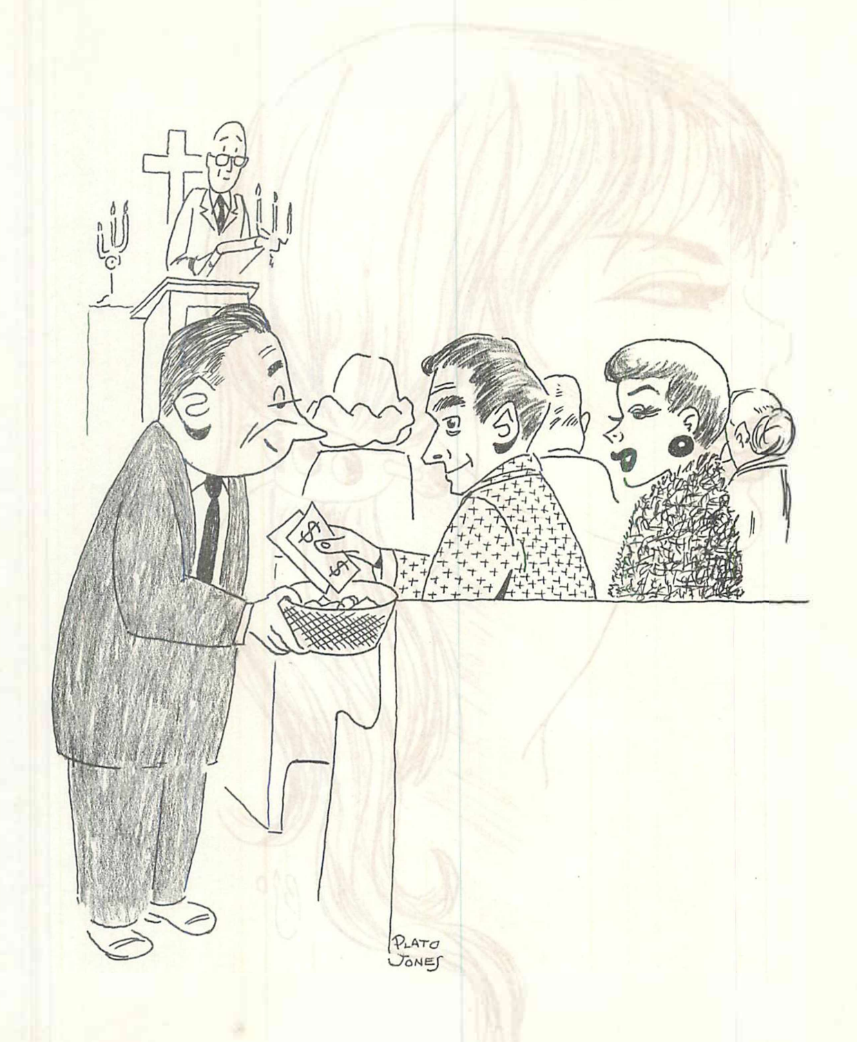
Remember HIM with a birthday gift.